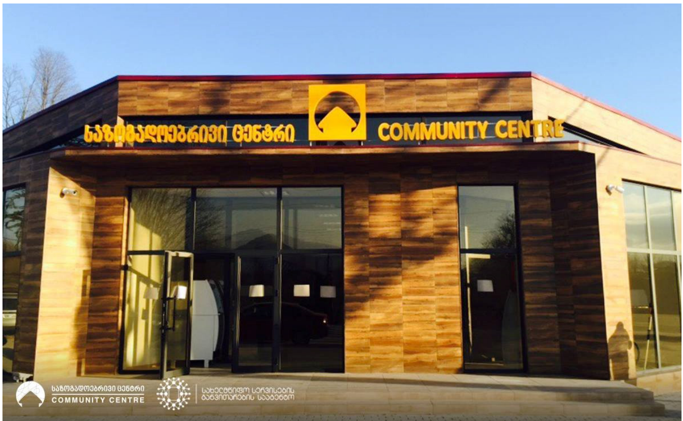
Picture 7 - Community Centre in Georgia