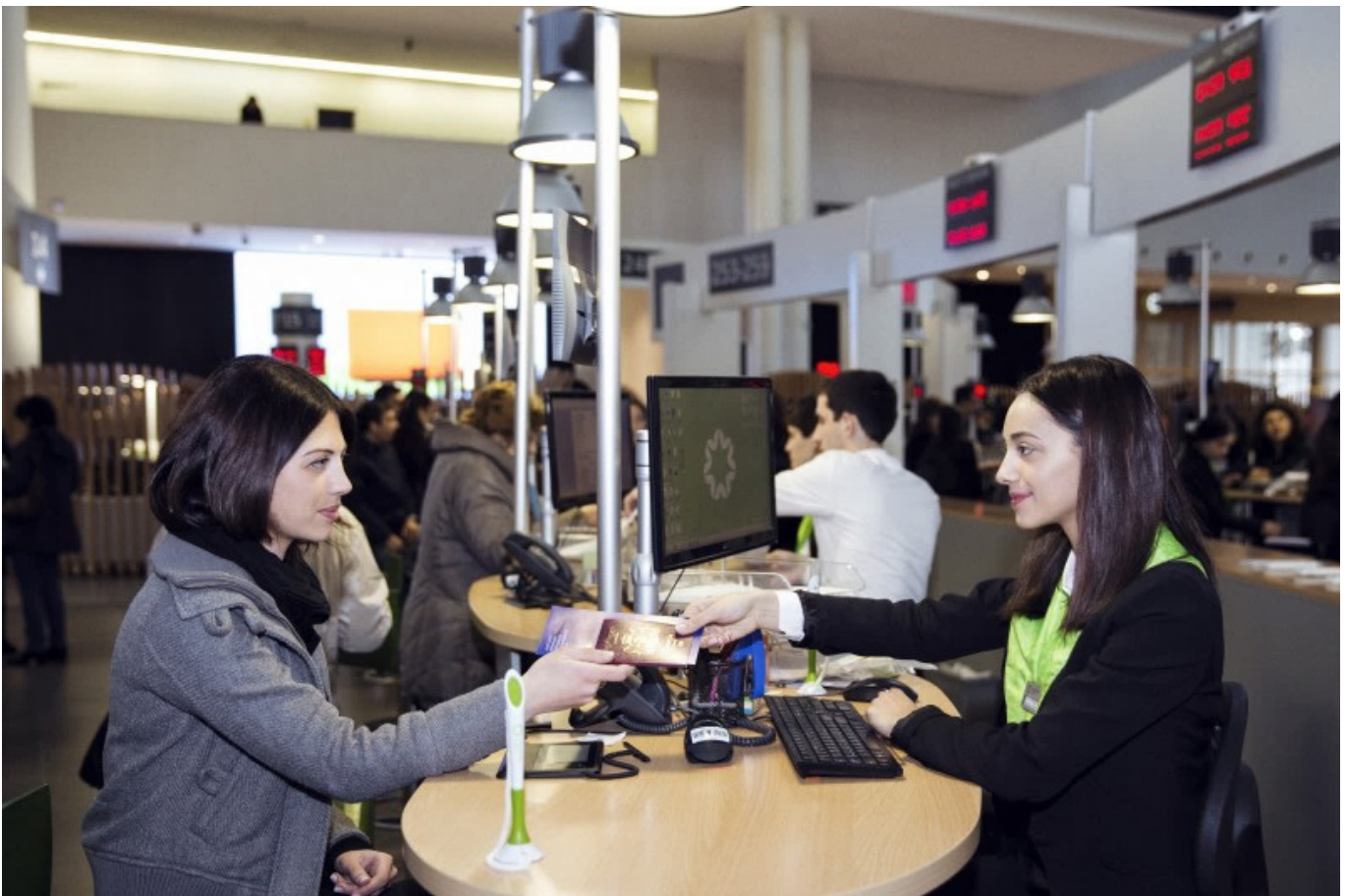
Picture 2 - New Biometric Passport at Public Service Hall

The unification process rationalized the system to the extent that regardless in which territorial unit a customer placed a request, the agency was able to issue a document on the spot, in the immediate vicinity of a customer. This of course streamlined information flow and ensured fast and higher-quality services delivery to citizens. In parallel, the agency established an electronic record keeping system to attain a unified, universally accessible civil register.