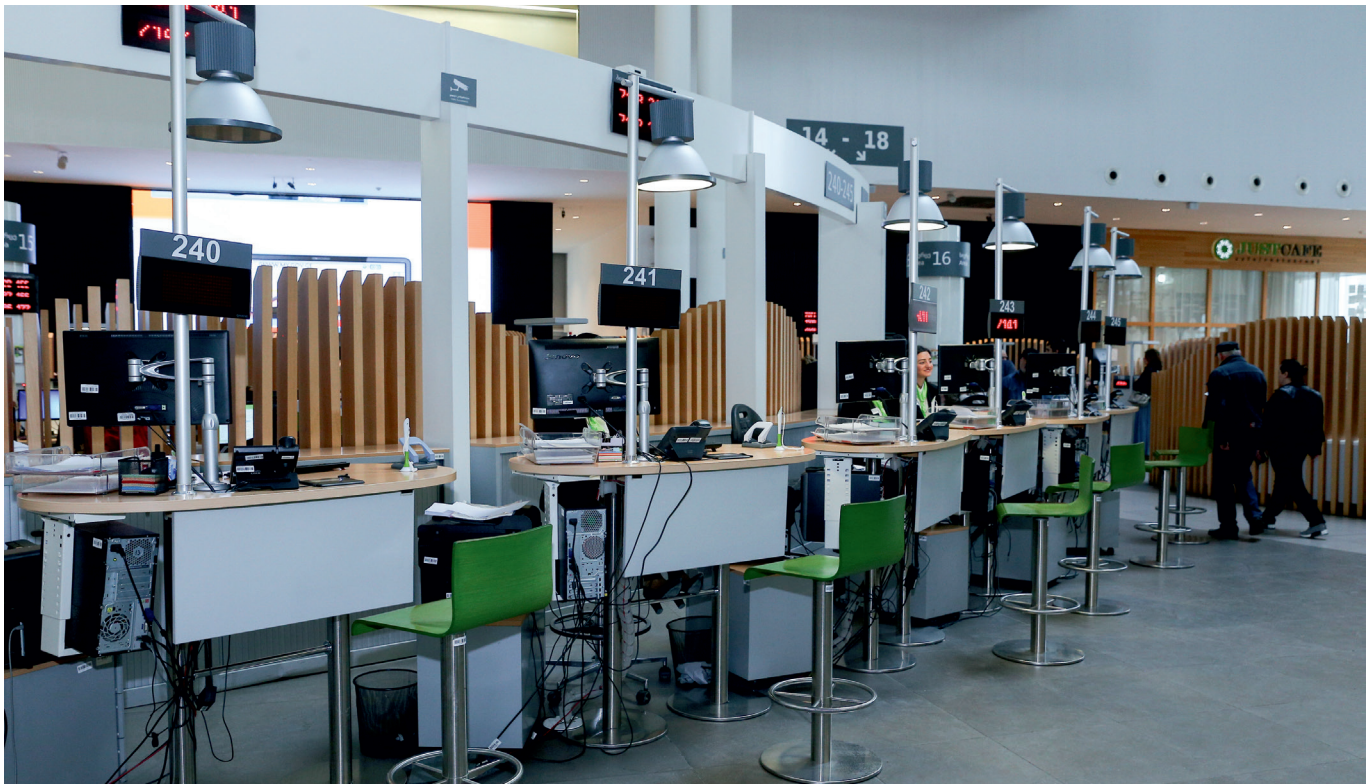
Picture 6 - Quick Service Area at Public Service Hall in Tbilisi

The complexity of public service provision requires thorough planning. Services are dichotomized into two broad, procedural and conceptual product groups. The procedural group includes services triggered by the demand from customers. Notably, these are the services that are mostly used and are highly requested by citizens, including civil and public registration services, services offered by notary bureaus, documents from national archive, cadaster maps etc. The second, conceptual group of services covers products that play an important role in strengthening the brand image of PSH. Services such as judicial consultation, trainings and seminars for customers fall under this category. Even though, all services taken together ensure that the PSH brand is strongly and positively positioned in the administrative service delivery structure, the first group does this via services that are process oriented while the second group contributes by emphasizing the importance of emotional value in service provision (MoJ, PSH marketing strategy, 2010).