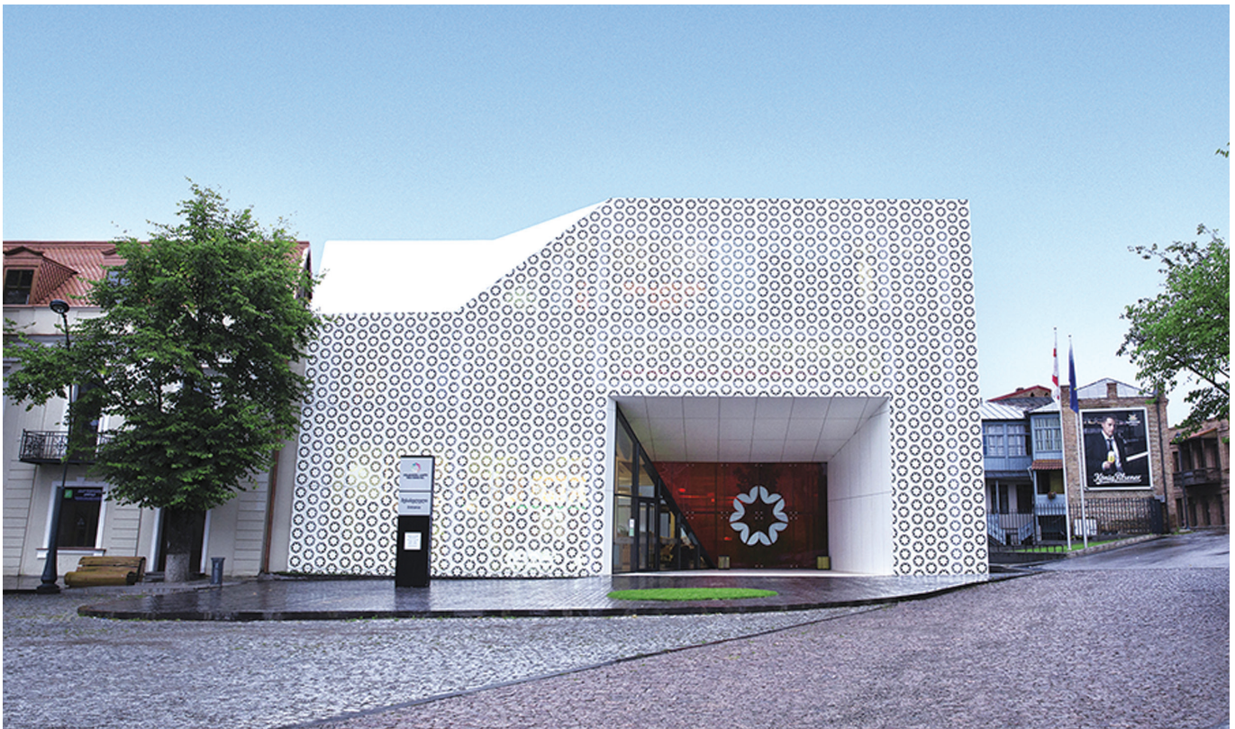
Picture 3 - Justice House Telavi, Eastern Georgia

The establishment and installation of central and backup servers ensured uninterrupted and online functioning of public services. This allowed the agency to operate an integrated information network and ensure up-to-date methods of information security. Moreover, the introduction of Virtual Private Network allowed the agency to connect all territorial offices to the network and helped to fully integrate its information flow throughout the country. This undoubtedly added great power and flexibility to a variety of CRA actions to further innovate and advance public services.