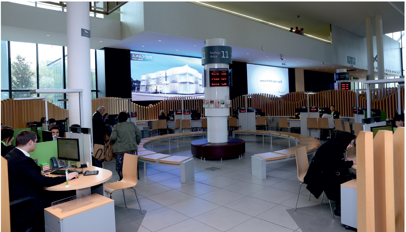
Picture 6 - Long Service Area at Public Service Hall

documentation to be supplied by a customer (PSH, 2016).