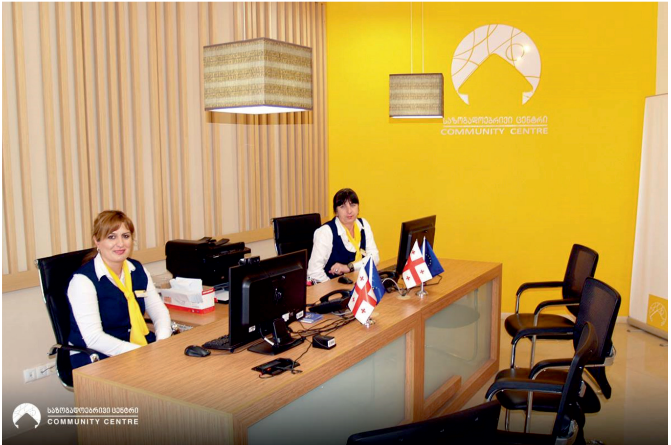
Picture 8 - Operators at Community Centre in Georgia

There are at least two operators working in each centre and one of them serves as an operations manager. Operators undergo a set of trainings prior to appointment. Trainings and continuous education is offered by the Trainings Centre of Justice and consists of a theoretical training, an internship and case studies. Initially, operators get familiarity with the legal and administrative base of the system. Then they are sent to a territorial office to receive practical, hands-on knowledge of service provision and acquire experience through practicing service provisions via specially designed case studies. In the end, an operator must pass a test to verify his/her knowledge. Moreover, SDA provides continuous planned and refreshment trainings to make them familiar with legal and administrative changes, to practice customer friendliness, software utilization etc. Operators must be able to master approximately five software solutions to provide services in a satisfactory manner (Interview with a respondent, 2016).