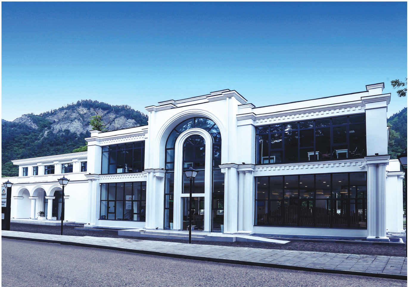
Picture 9 - Justice House in Borjomi, Southern Georgia