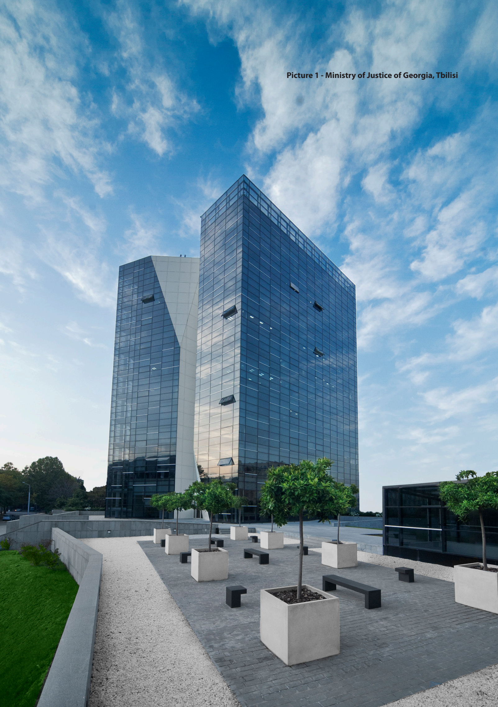
Picture 1 - Ministry of Justice of Georgia, Tbilisi