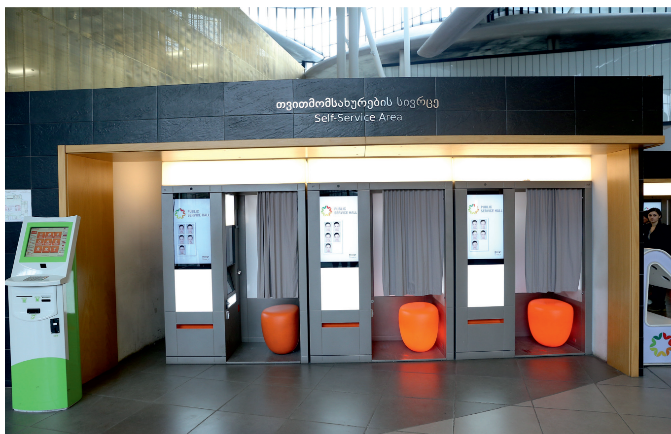
Picture 5 - Self-Service Area at Public Service Hall in Tbilisi

related services are powered by Service Development Agency; power of attorney is offered by the Notary Chamber; National Bureau of Enforcement offers services to execute the decisions made by court order; Training Center of Justice offers judicial consultation and trainings for customers and Minister of Education uses PSH to provide school attestation certificates to citizens.